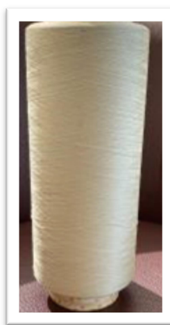
Copper ion yarn.filament 75/72